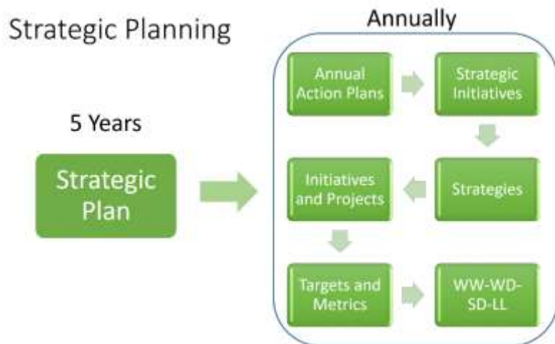
Figure 2. Simplified translation from strategic plan to annual implementation plan (from Julie Defilippi Simpson)