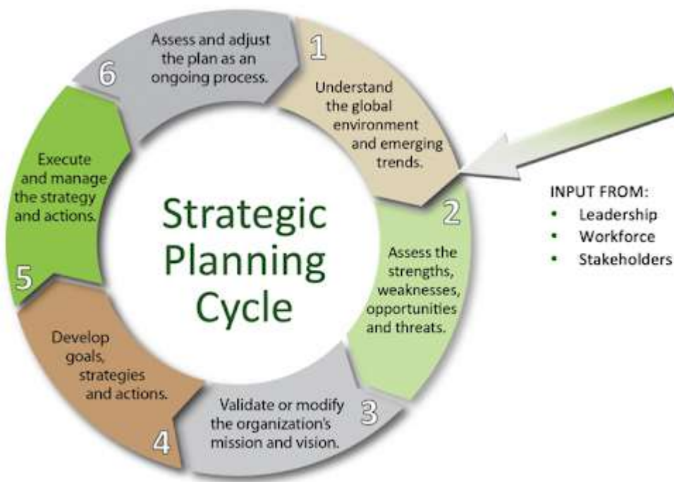
Figure 1. Typical strategic planning cycle – similar to an adaptive planning process.